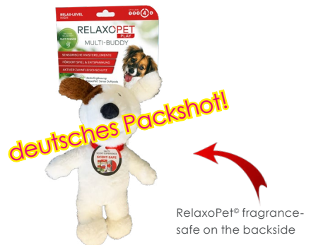
RelaxoPet® fragrance-safe on the backside

The Multi-Buddy is equipped with sensory crackling elements to satisfy the natural instincts of dogs. The special tissue cleans the teeth and thus contributes to the oral hygiene of the dog.